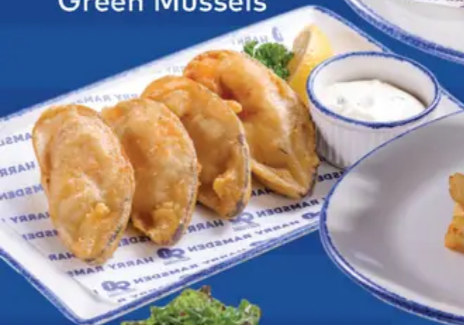
Battered Green Mussels