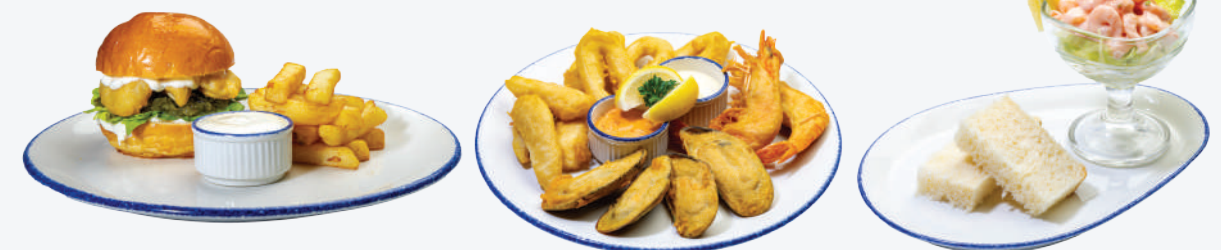
Image shown is for illustration purposes only. All prices quoted in Ringgit Malaysia and inclusive of service tax at prevailing rate which applicable.