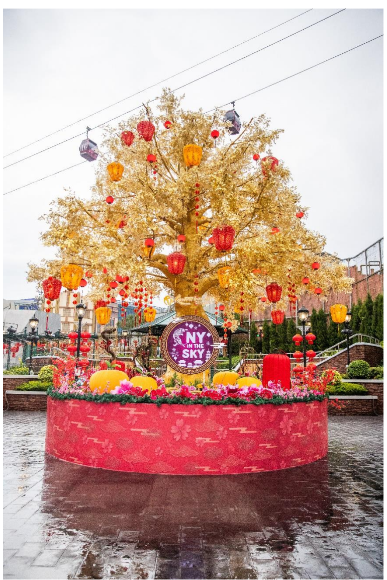
7-metre tall golden tree with lanterns at Central Park.