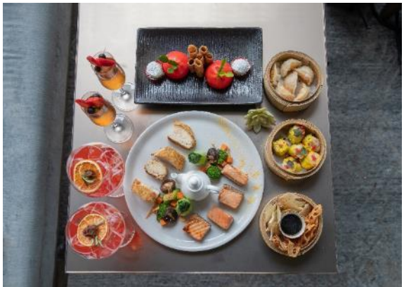
Exclusive CNY Eve dining package at Park Avenue Lounge