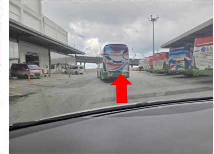
Keep straight to reach the parking/standby area