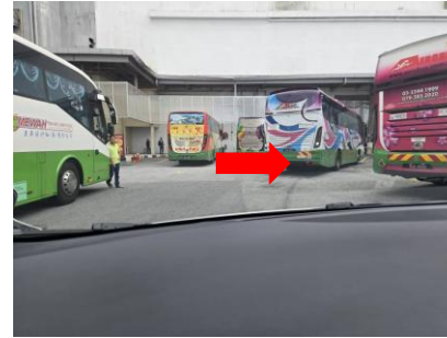
Drive straight and turn right ahead