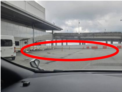
Up ahead is the area for parking/ standby