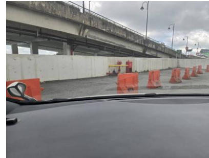
There will be PIC standby for guidance at the parking area