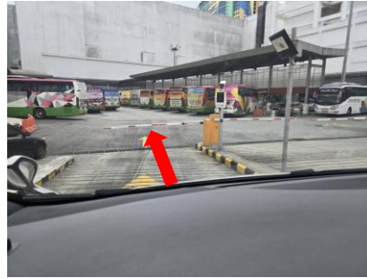
Wait for the gate to open