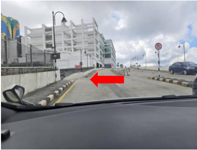
Turn left into the entrance of the Genting Main Terminal