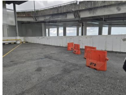
There will be PIC standby for guidance at the parking area